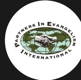
PARTNERS IN EVANGELISM INTERNATIONAL