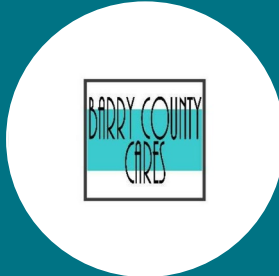
BARRY COUNTY CARES