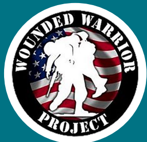
WOUNDED WARRIOR PROJECT