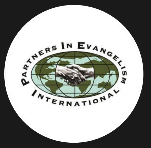
PARTNERS IN EVANGELISM INTERNATIONAL