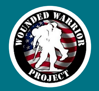
WOUNDED WARRIOR PROJECT